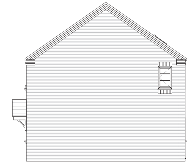
6 Side Elevation 2 1 : 100